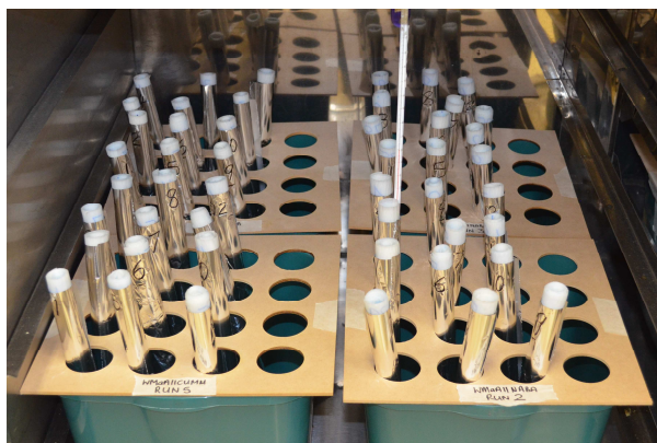
Figure 3: Seeds germinating in temperature controlled cabinet.

The seeds were germinated in moistened filter paper 'cigars', which were placed in a darkened, temperature-controlled cabinet (Figure 3). The length of the coleoptile was measured after 14 days at 21° C. Individual seeds with a coleoptile length of less than 4 cm were not considered viable and were recorded as missing data.