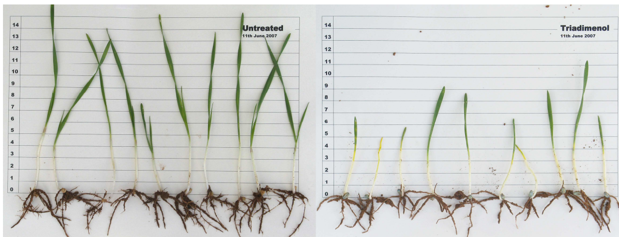
Figure 2: Untreated seed compared with seed treated with the fungicide triadimenol showing the effects on coleoptile length, seed emergence and early plant growth from a seed fungicide demonstration at Temora in 2007.

Seed from three early sown and seven main season sown trials were tested for coleoptile length. These trials were chosen on the basis of having satisfied the normal grain quality recovery standards for screenings, test weight and falling number.