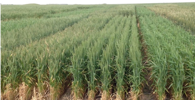
DS Pascal in front centre right plot. Internal trials, Lake Bolac, south west Victoria.